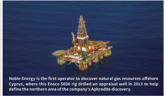
Noble Energy is the first operator to discover natural gas resources offshore Cyprus, where this Enso 5006 rig drilled an appraisal well in 2013 to help define the northern area of the company's Aphrodite discovery.

"Our significant world-class discoveries in the Eastern Mediterranean provide an exceptional opportunity to deliver energy security and economic development for